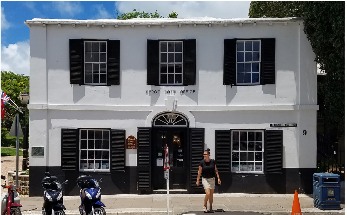
01 Used at the Philatelic Bureau