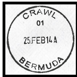
01 held at PB